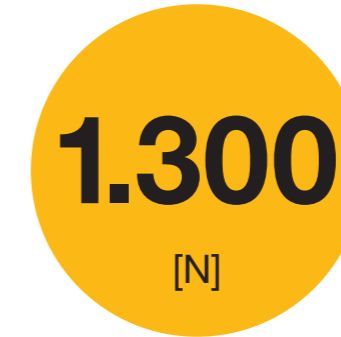
VKA welding force according to DIN 51350