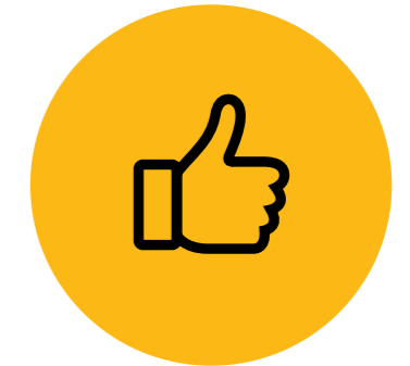
Very good washability according to DIN 62136-1 Appendix B*