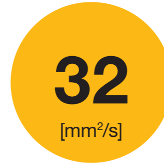
Basic oil viscosity at 40 °C