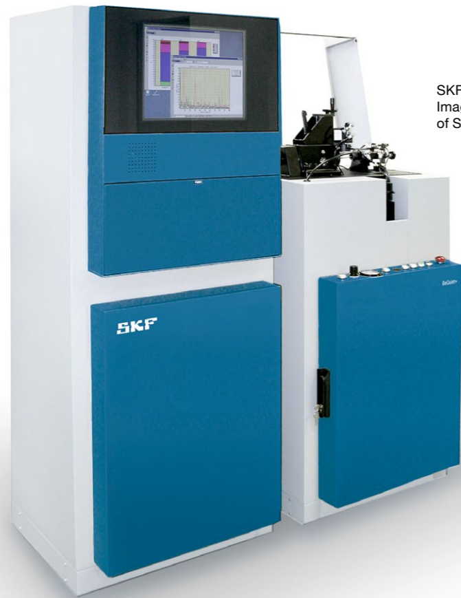
SKF BeQuiet+ test rig.